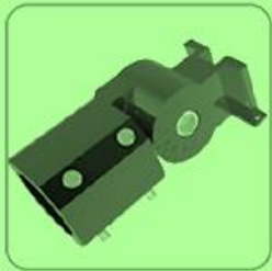
HS-01 Slip fitter