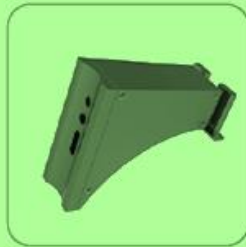
HS-02 Round pole mount