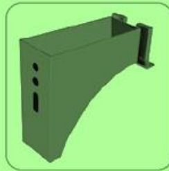
HS-03 Square pole/Wall mount